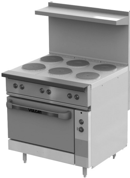
Model EV36S-6FP208 shown with adjustable legs