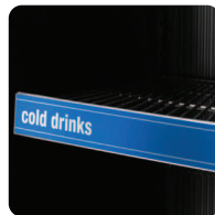
Clear, Hinged Menu / Price Strips